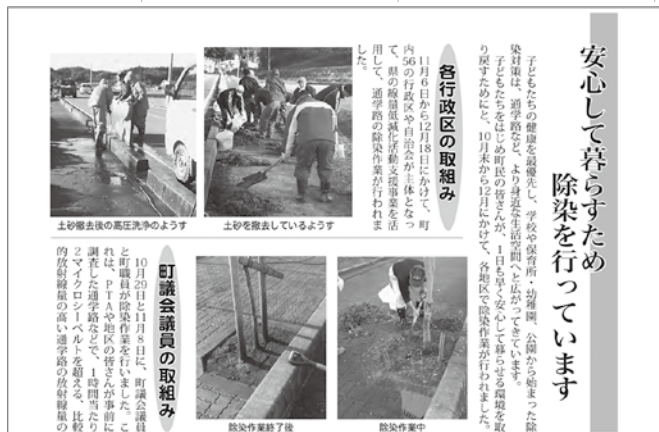
Figure 1: Town News reporting the decontamination activities by resident (district) organizations

For example, in Miharu Town in Fukushima Prefecture, located approximately 45km from Fukushima Daiichi Nuclear Power Plant, a resident organization called the Town Development Association established a disaster headquarters in each administrative district immediately after the accident. When the Fukushima Prefecture announced the policy of providing resident organizations with financial support to carry out decontamination projects (for example, providing money to purchase high-pressure washing machines for the dose