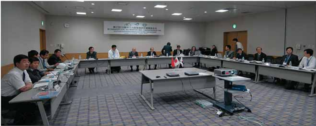
Tripartite Presidents Meeting