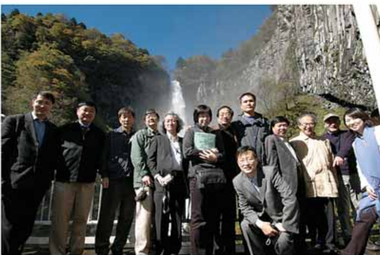
華嚴滝 Kegon-no-taki Falls