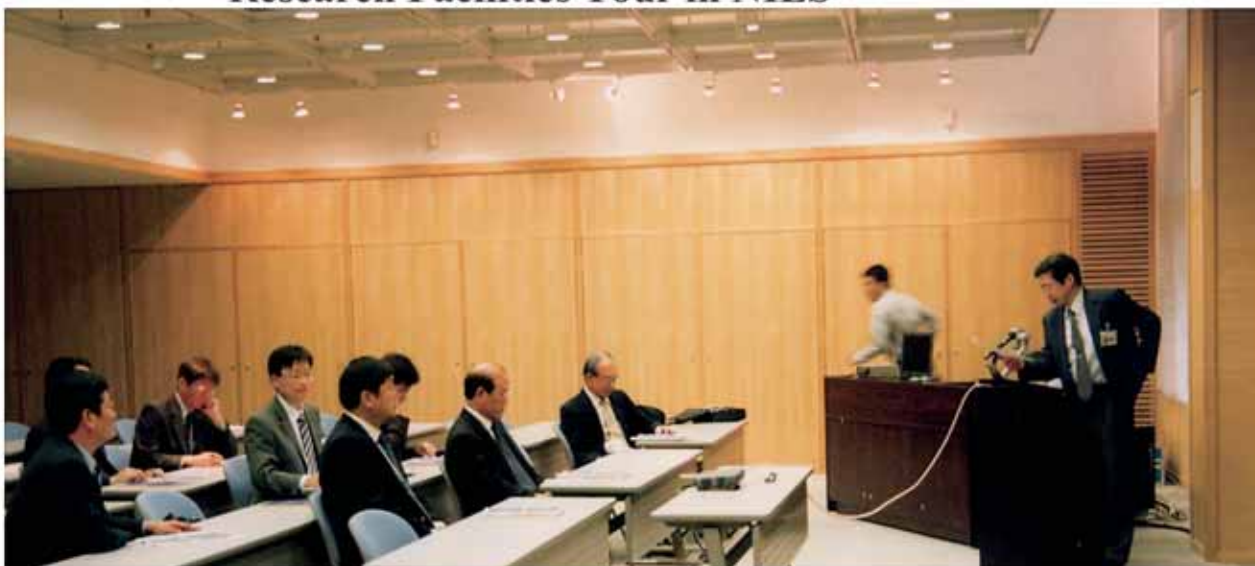
Climate Change Research Hall