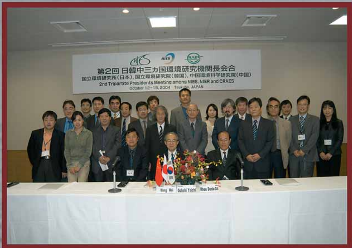
Participants of the 2 nd Tripartite Presidents Meeting