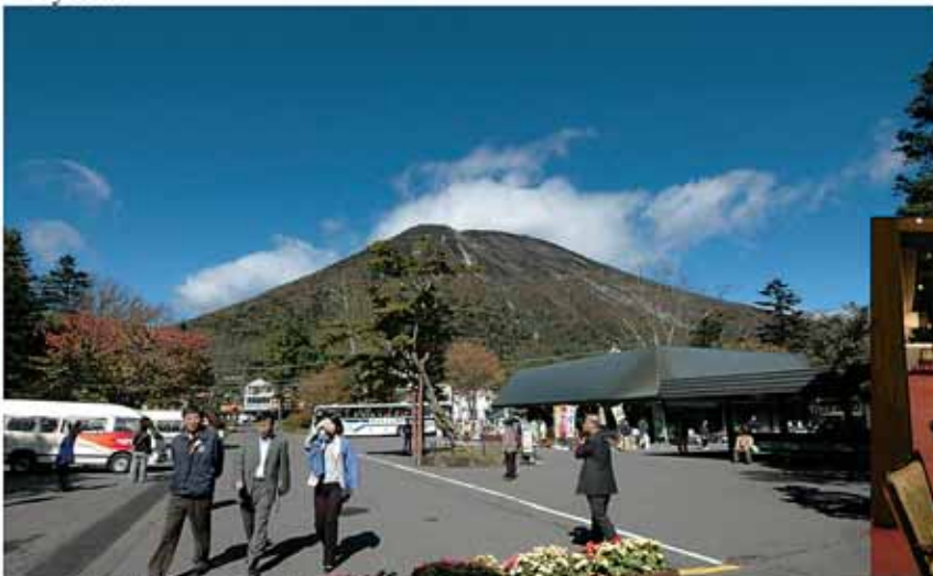
男体山 Mt. Nantai-san