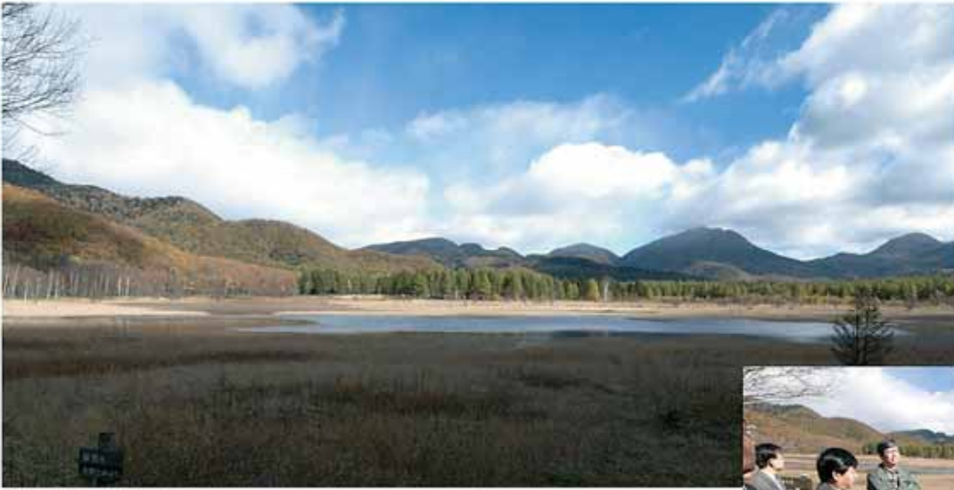
小田代ヶ原 Odashiro-ga-hara Wetland