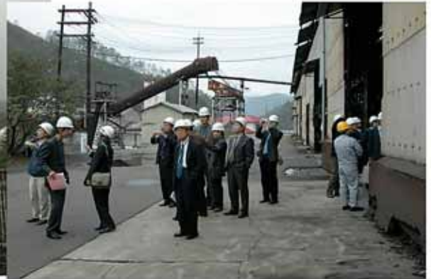
Ashio Copper Smelting Works (Closed)