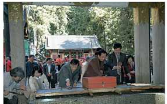
日光東照宮 Nikko Toshogu Shrine