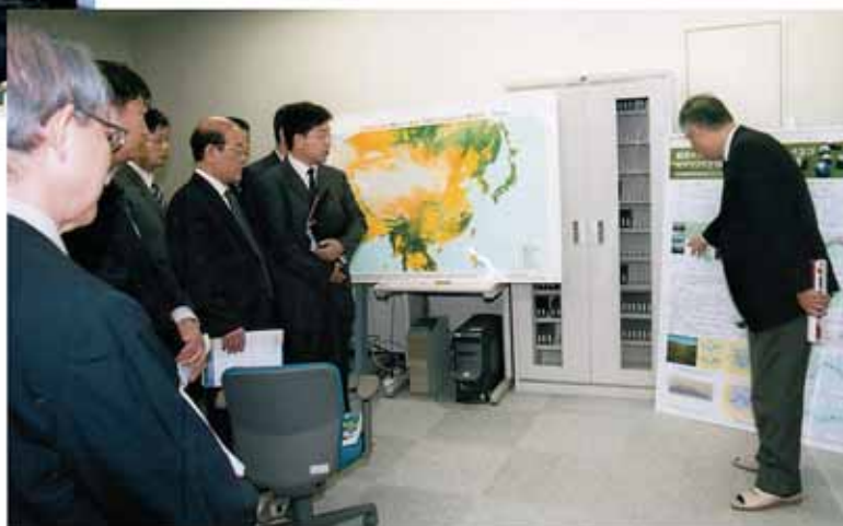
Soil Environment Lab.