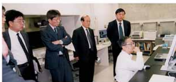
MRI in Endocrine Disrupter Research Lab.