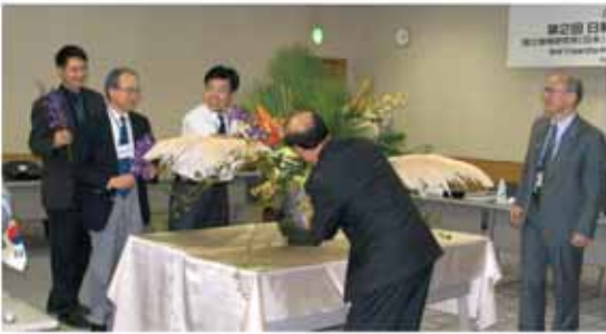
華道 Flower Arrangement