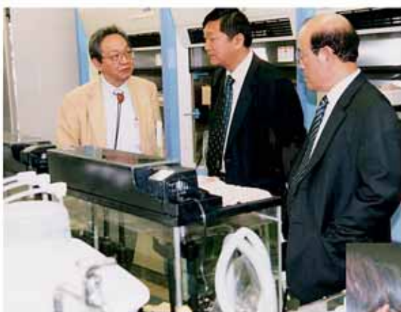
Endocrine Disrupter Research Lab.