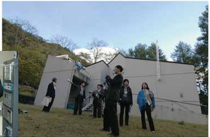
Oku-Nikko Field Station