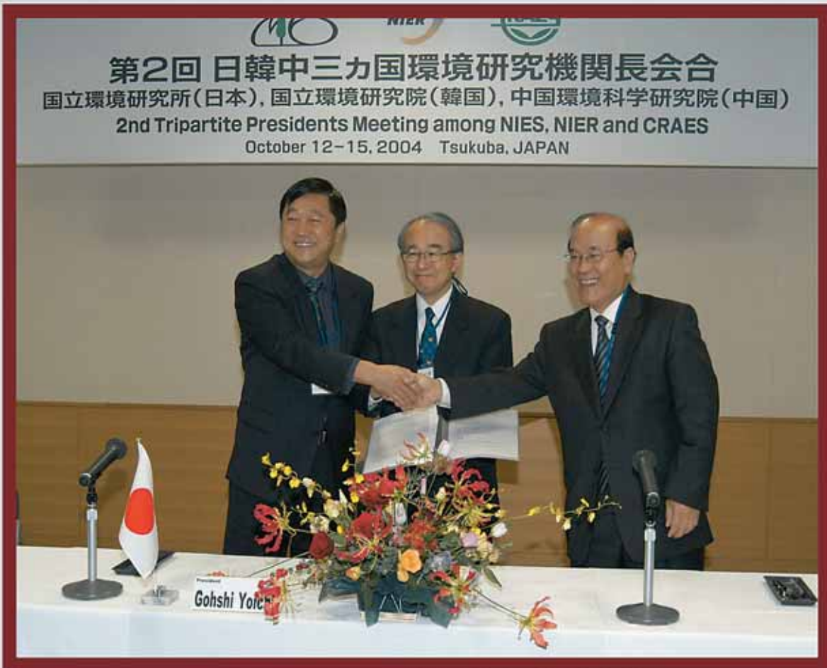
Tripartite Presidents after Undersigning the Joint Communiqué