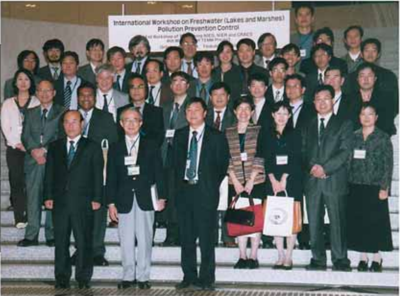
Picture after the 1st Workshop of TPM