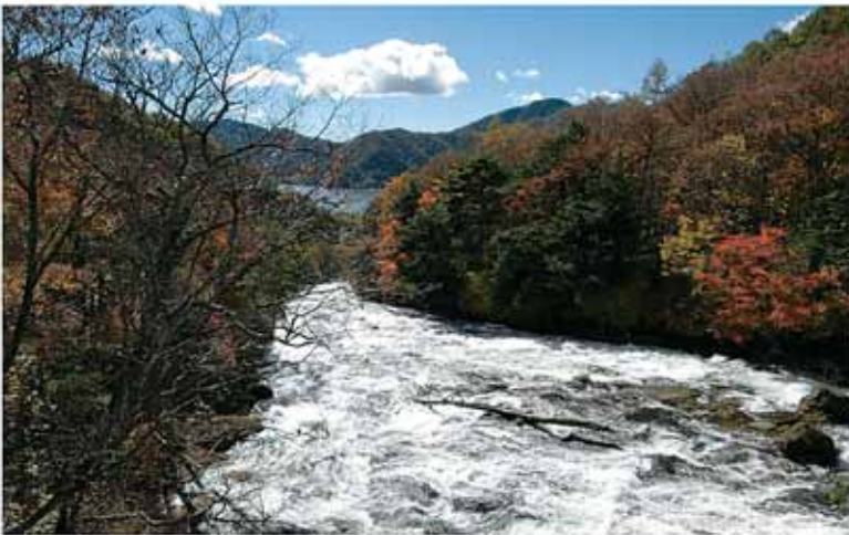
竜頭滝 Ryuzu-no-taki Waterfall