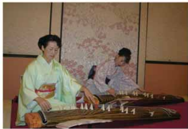
琴 Playing The Koto (Japanese Harp)