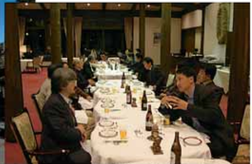
Dinner at Nikko Prince Hotel