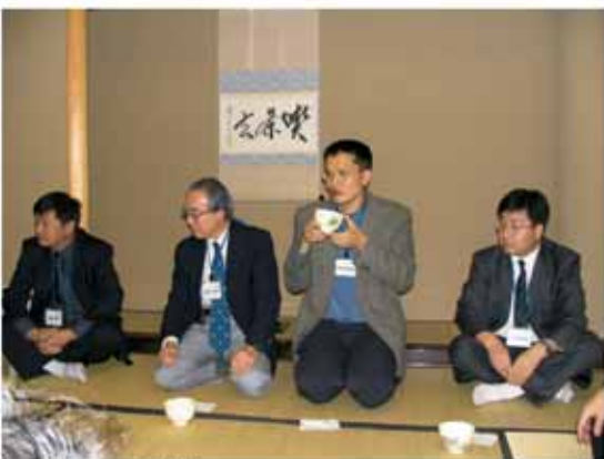
茶道 The Tea Ceremony